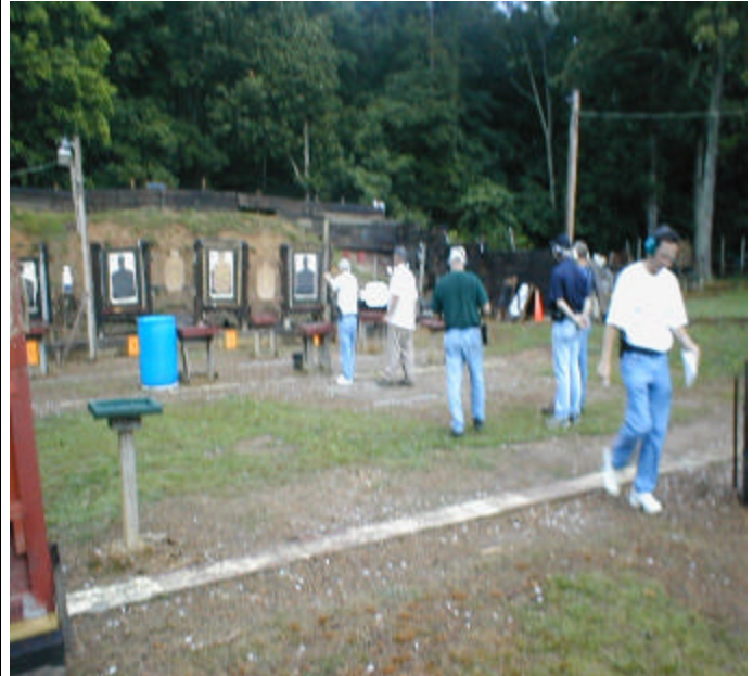
On the firing line or waiting your turn, everyone has a great time and gets some great instruction.

You're not just trusting your life to your training, but the guy next to you will be trusting his life to it too.