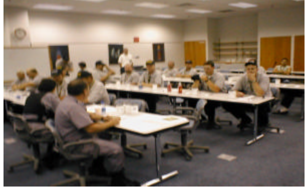
Homeland Security in the classroom at Watts Bar